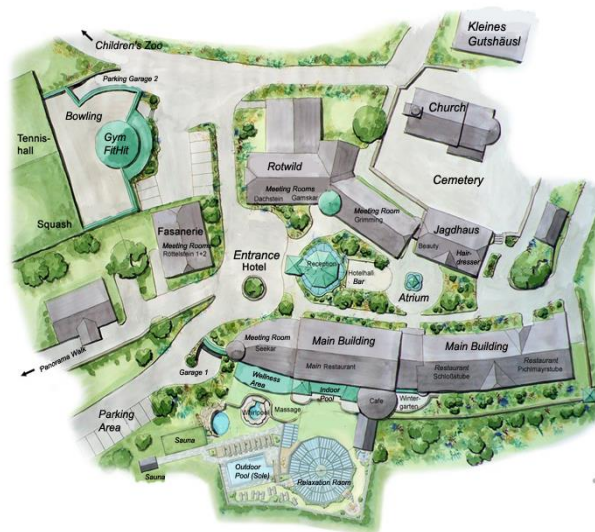
Symposion Hotel Pichlmayrgut - Layout Plan

Room Photos and Plan: Symposion Hotel Pichlmayrgut