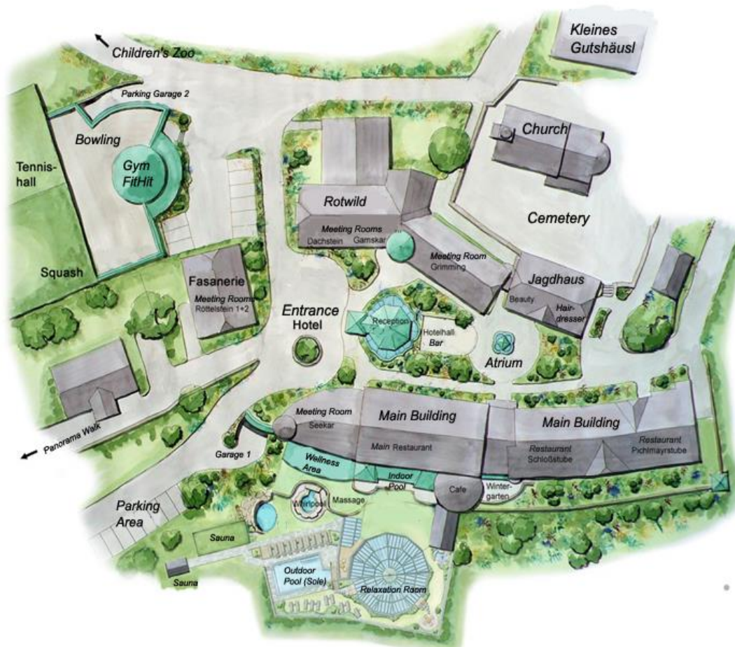
Symposion Hotel Pichlmayrgut - Layout Plan

Room Photos and Plan: Symposion Hotel Pichlmayrgut